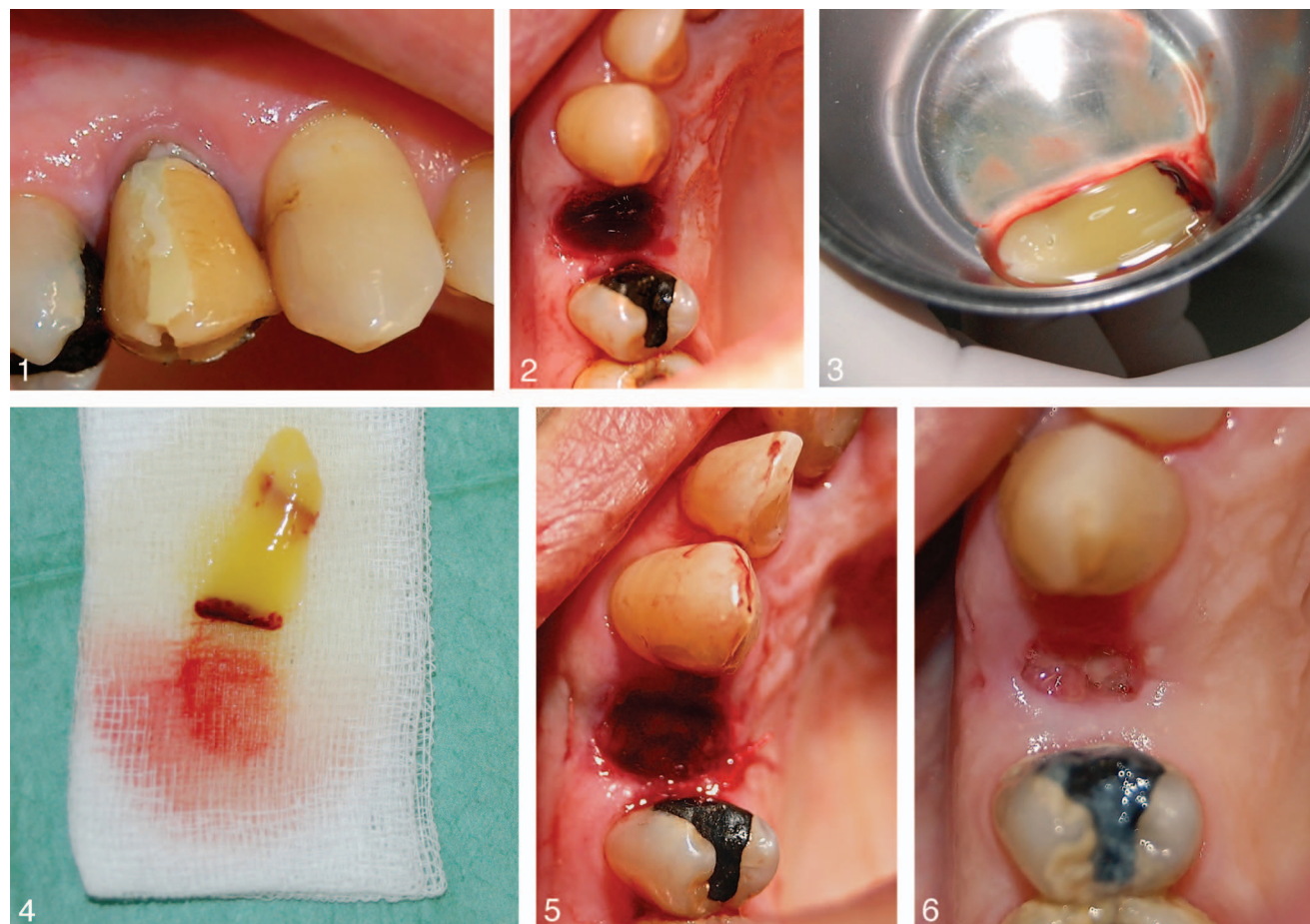
FIGURES 1–6. FIGURE 1. Baseline clinical view of the hopeless maxillary first premolar. FIGURE 2. Intraoperative view following tooth extraction. Note the maintenance of gingival contours owing to the atraumatic extraction technique. FIGURE 3. Platelet rich fibrin (PRF) clot immediately following extraction from the centrifuged blood sample vial. FIGURE 4. Fibrin membrane formed following manipulation of the PRF clot. FIGURE 5. Clinical view at the end of the surgical procedure. FIGURE 6. Clinical view at 2 weeks postoperatively showing complete epithelization.

postextraction sockets while minimizing the duration of the treatment.