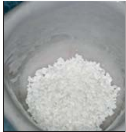
Fig 9c ABBM was used to fill the extraction socket. When a particulate bone graft is used, it must be hydrated prior to application in the defect; in contrast, the putty is premixed and readily available for application intraorally.