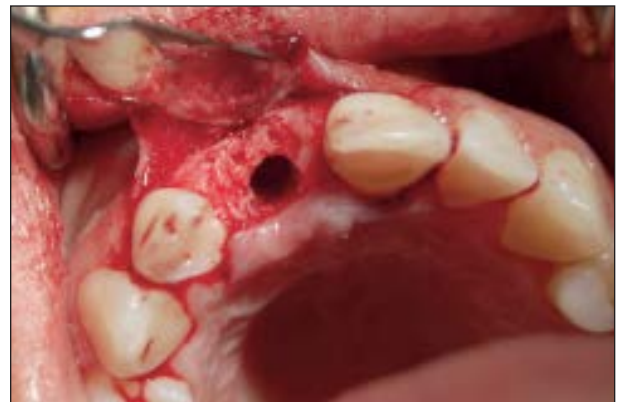
Fig 8 Implant placement was performed by the same surgeon following a standardized protocol to minimize errors in MIT measurements. Note the good preservation of the buccal plate after 5 months of healing.

complications, including infection, wound dehiscence, and resorption. Clinical and radiographic postoperative measurements were recorded at approximately 5 months by the same blinded examiner who had performed the baseline measurements and was not involved in the surgical treatment (Figs 7a and 7b).