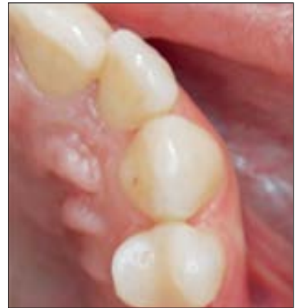
Fig 9f Clinical view of postoperative healing revealed very good maintenance of alveolar ridge width. In this clinical case, 0.5 mm of loss in the orofacial dimension was recorded at 5 months postextraction.