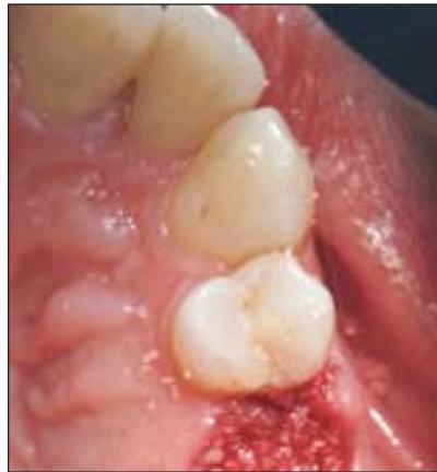
Fig 9e Clinical image of the socket filled with ABBM to the level of the bone crest. Subsequently, a collagen plug was placed to contain the bone particles according to the "socket-plug" technique.