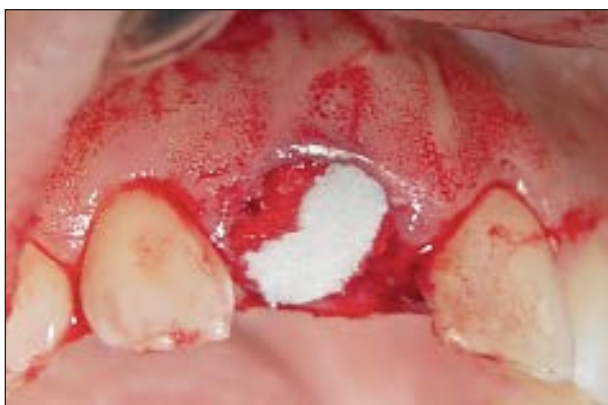
Fig 5 The collagen plug is placed over the graft and becomes moldable when it comes into contact with blood.