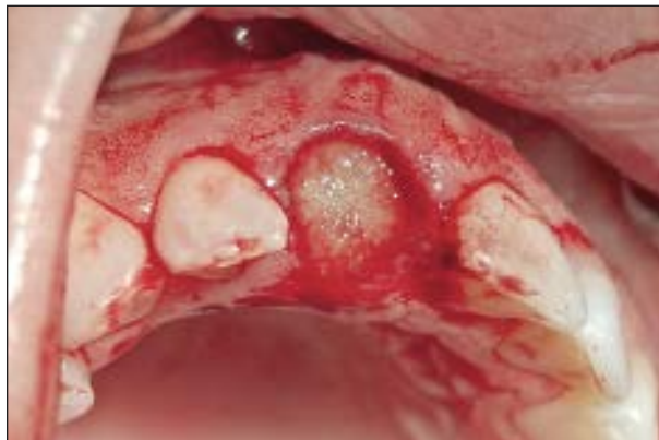
Fig 4 Socket filled with putty bone substitute. The handling characteristics of putty materials allow for the filling of the socket in a single step, in contrast to particulate bone substitutes.