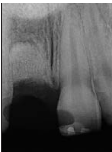
Fig 6 (Right) Periapical radiograph showing the even fill of the socket thanks to the flow of the putty.

technique used in this study was previously described by Kotsakis et al. 27 The procedure consisted of cutting through the epithelial attachment with a 15c or 12b blade to transect the supracrestal fibers, severing the periodontal ligament fibers with a sharp periosteal, and completion of atraumatic tooth extraction as previously described (Figs 2a and 2b).