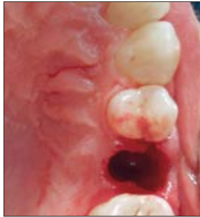
Fig 9b Atraumatic extraction led to maintenance of the soft tissue architecture in the area and prevented fracture of the buccal plate.