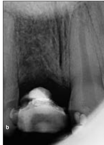
Figs 7a and 7b Clinical view of the healed ridge at 5 months postextraction. Adequate bone width preservation is evident. Radiographically, the trabecularization of the healed socket can be seen to resemble that of the neighboring pristine bone.