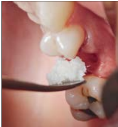
Fig 9d The particulate ABBM was delivered in increments using a Goldman-Fox elevator.