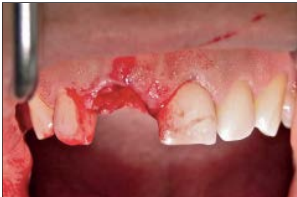
Fig 3 Atraumatic handling of the socket during extraction allowed for preservation of the soft tissue architecture of the area.